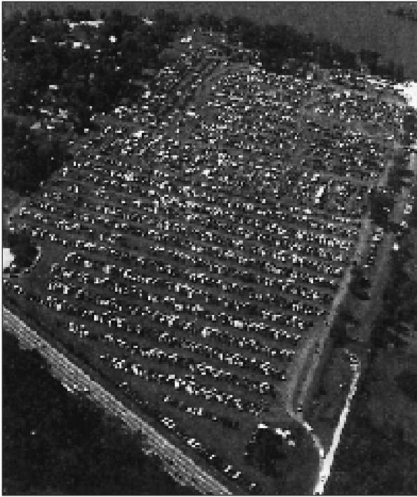
AERIAL VIEW OF AUTORAMA